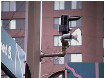
SIGNAL MOUNTING EQUIPMENT